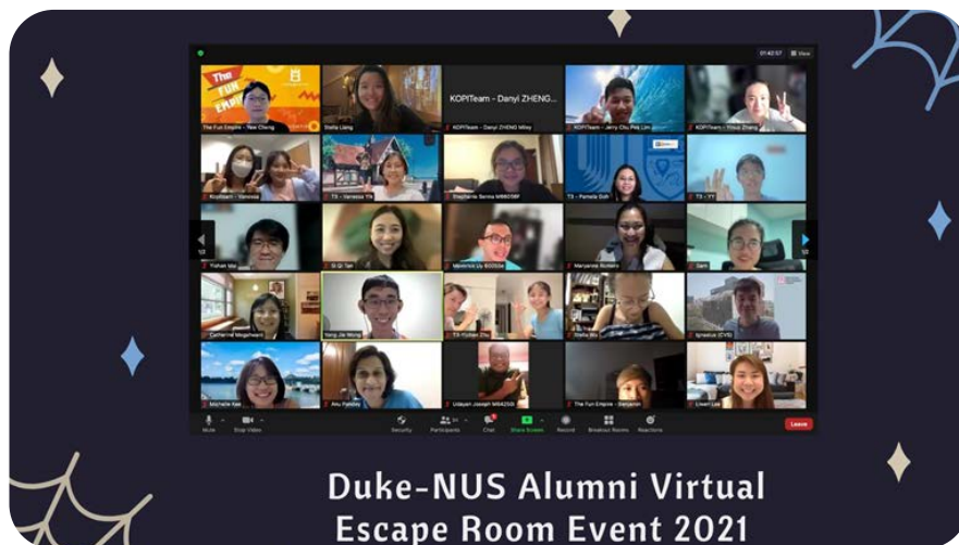
Duke-NUS Alumni Virtual Escape Room Event 2021

This Halloween, we invited alumni and students (MD and PhD alike) to join us for a virtual escape room event. Eight teams raced to be the first to break the werewolf's curse and spent an hour and a half pouring over a handful of clues in order to find out which werewolf they had to face. In the end, KOPITeam, a team of PhD students, emerged victorious and secured the bounty offered for saving us all from the werewolf's attack.