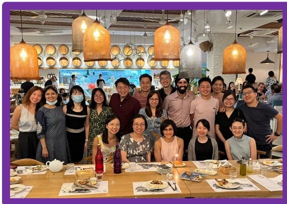
5 th August 2022 Classes of 2011, 2015 & 2019