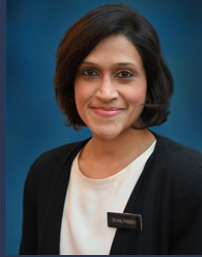
ASSOCIATE CONSULTANT, PEDIATRICS, KKH