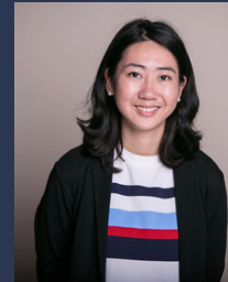
ASSOCIATE CONSULTANT, CARDIOLOGY, NHCS