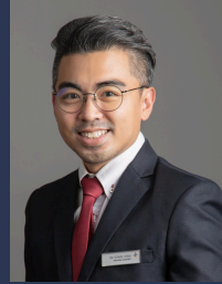
ASSOCIATE CONSULTANT, GENERAL SURGERY COLORECTAL SERVICE, NUHS