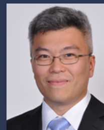
CONSULTANT, NEURORADIOLOGY, SGH