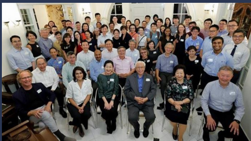
Movie Night 2024, 15 Mar 2024