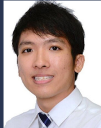
ASSOCIATE CONSULTANT, GASTROENTEROLOGY, SGH