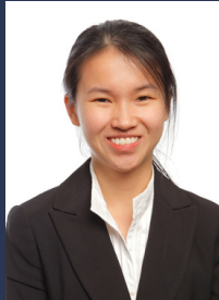
GENERAL PRACTITIONER, WHITE COAT