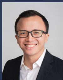
ASSOCIATE CONSULTANT, CARDIOLOGY, CGH