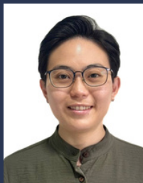
MEDICAL OFFICER /RESIDENT, SGH