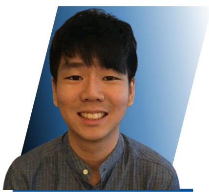
ONG Ken Kit Bennett